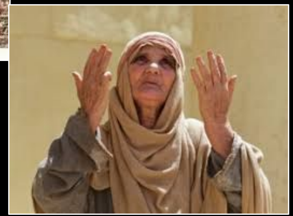
"Simeon and Anna" from Luke 2:21-40